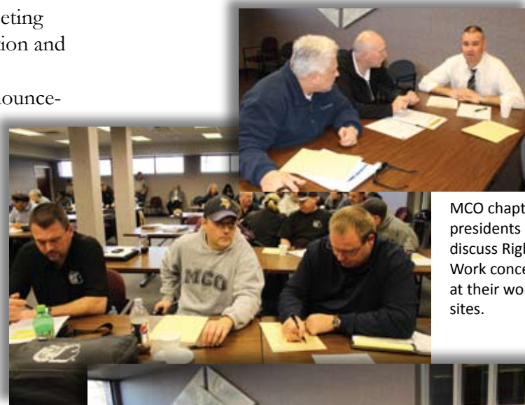
MCO chapter presidents discuss Right to Work concerns at their work sites.

Chapter presidents wrote down and discussed the RTW-related concerns and questions they're hearing most at the facilities.